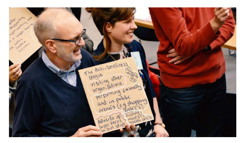
'Call to Action' Event, People's History Museum, Manchester, 21 March 2017

In this section we describe the activities that are underway in six NHS vanguards that are part of the Health as a Social Movement programme. We have picked out examples of where they show signs of success as well as certain challenges that have been identified by some of the sites. We identify key learning points from each vanguard.