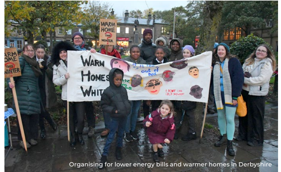
Organising for lower energy bills and warmer homes in Derbyshire

The cost of living scandal and climate breakdown have the same root cause: expensive oil and gas. But, rather than seeing Putin's invasion of Ukraine as a warning of the dangers of reliance on oil and gas, many politicians and commentators are painting fossil fuels as the answer to energy security. Of course, the opposite is true. From banning onshore wind to ending home insulation programmes, it is our slow progress towards net zero that has left us exposed to the international energy market and climate breakdown. We need action now to protect the planet and increase our energy security.