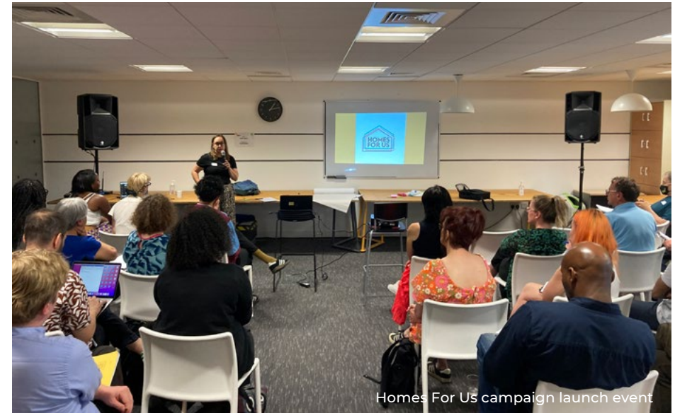
Homes For Us campaign launch event

It is unacceptable that in one of the richest countries in the world, at a time of record corporate profits, so many people in the UK are struggling to afford life's essentials. The cost of living scandal has heaped unimaginable pain on ordinary people. According to our own analysis, at the start of this year around one third of the UK population had an income below the level you need for a decent standard of living.