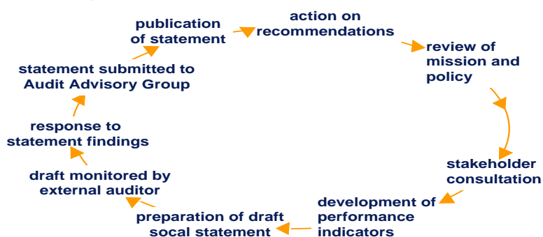
diagram from The Values Report 1997, The Body Shop International

There are four 'building blocks' used in the social audit method: